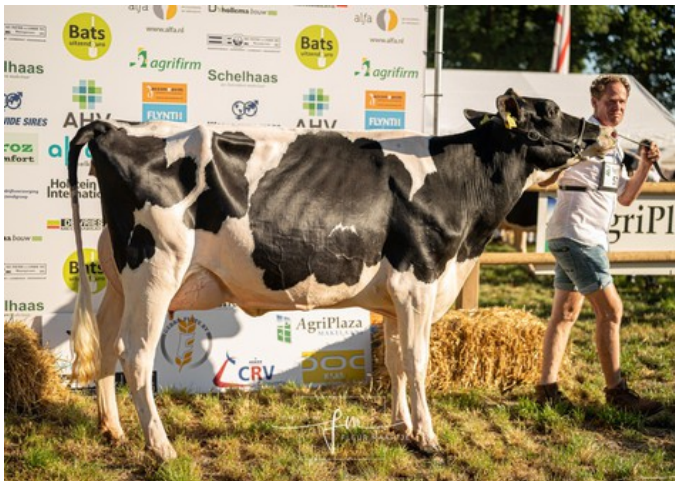
Charity 53 VG-86