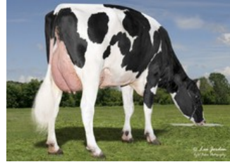
Bomaz Delta 7166 (Delta x Bomaz)