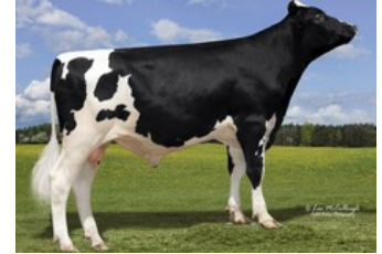
Bomaz AltaTopshot (Supershot x)

GP-84 Riveting x Salvatore Rc x VG-88 Delta x GP-81 AltaEmbassy x VG-85 Robust x VG-85 Man-O-Man x VG-85 Lancelot x VG-85 Addison x VG-85 Sand x VG-87 Daggat