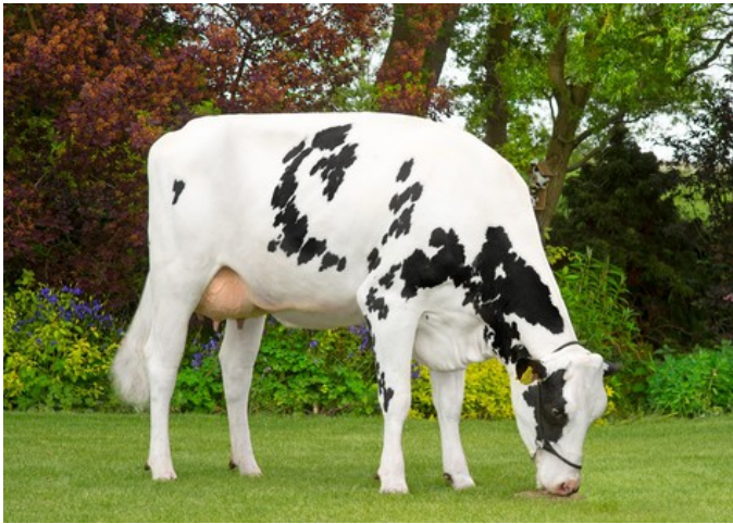
3STAR RT Patsy RDC GP-84