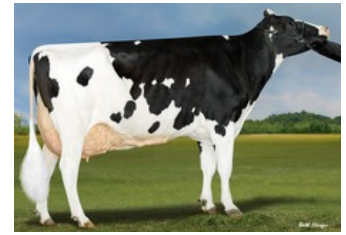
Bomaz Delta 7173-ET VG-88