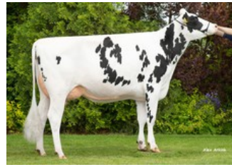
3STAR RT Patsy RDC GP-84