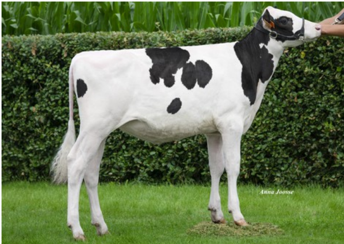
Zwanebloem Solution Shimmer GP-82