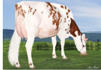
Lesperron Aikman Sofia-Red VG-88-