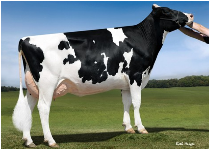
Cookiecutter Ssire Have VG-86