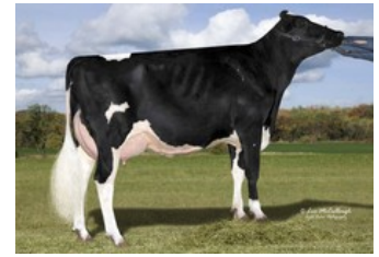
Cookiecutter MOM Halo VG-88