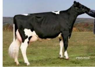
Cookiecutter GLD Holler VG-88