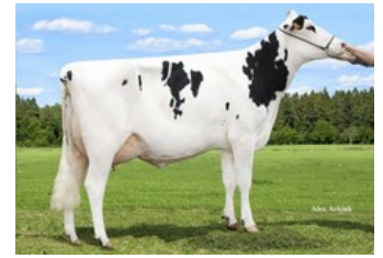
DKR Silence Secret RC VG-85