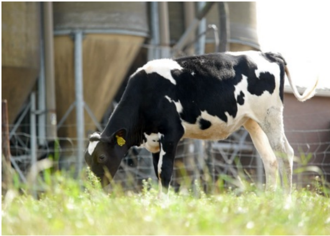
Drouner 3STAR Mabel 1733 GP-83