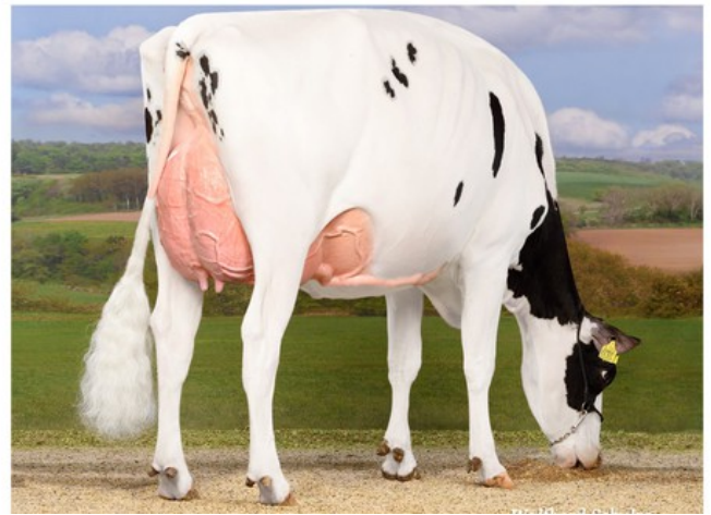
PR Darlina EX-90

EX-90 Artist x EX-90 Spark x EX-90 Mogul x EX-90 Snowman x EX-91 Goldwyn x VG-89 Shottle x VG-88 BW Marshall x VG-87 Jolt x VG-86 Bell Elton x EX-95 Chief Mark