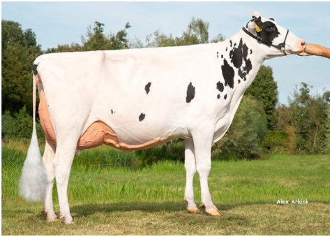
HBC PR Darlina 2 EX-90