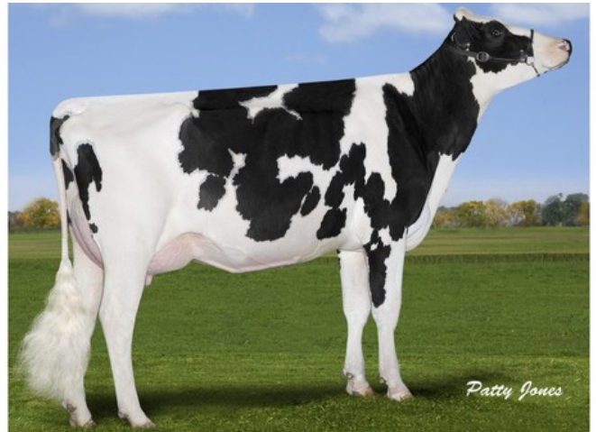
Gen-I-Beq Snowman Summer RDC VG-85

AltaDateline x Rubi-Asp*Rc x Supershot x VG-85 Sympatico RF x VG-85 Snowman x VG-87 Bolton x VG-87 Goldwyn x VG-87 Durham x VG-86 Formation x VG-88 Aerostar