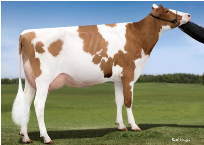
Snowbiz Sympatico Sofia Red VG-85