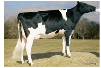
Pine-Tree Martha Sheen VG-86