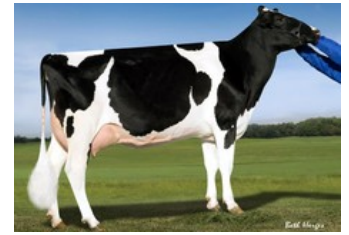
Pine-Tree 2149Robst 4846 VG-87