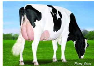
View-Home Mcc Found VG-88