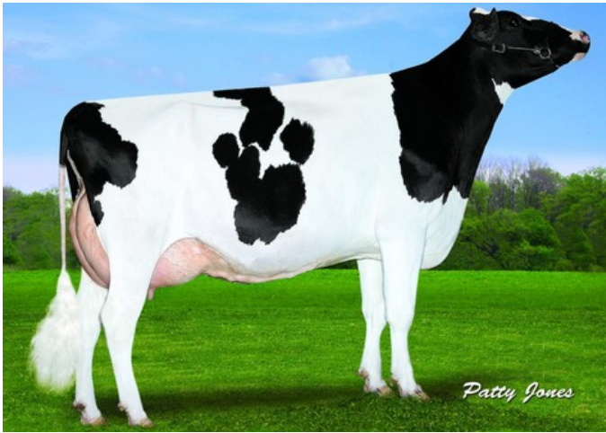
View-Home Mcc Found VG-88