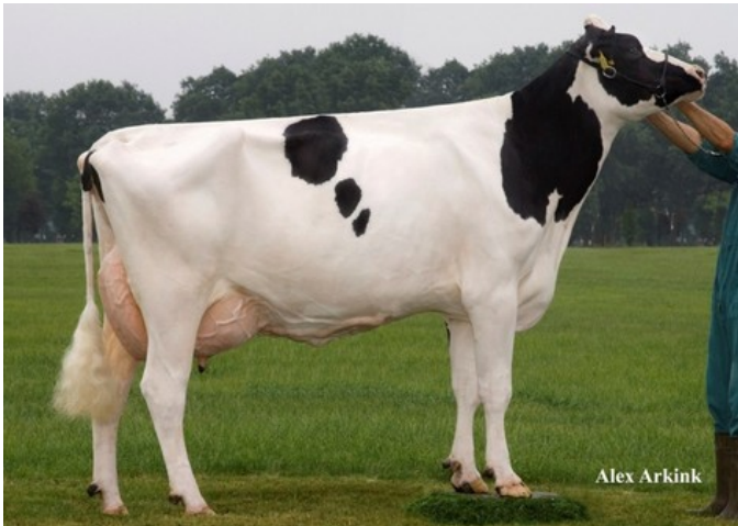
Broeks MBM Elsa EX-90