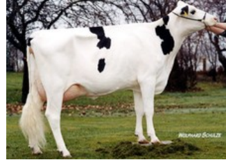
KNS Daylight EX-90