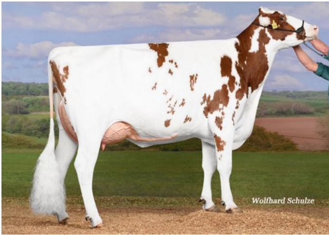
KNS Daddy Cool Red VG-85