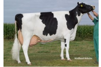
KNS Daybright EX-91

GP-82 Gywer RDC x VG-85 Styx Red x Apoll P Red x VG-87 Balisto x GP-84 Shamrock x VG-85 Man-O-Man x EX-91 Goldwyn x EX-90 Lee x EX-93 Integrity x VG-85 Prelude