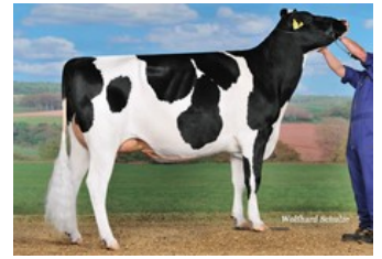
KNS Dream Rock GP-84