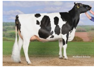
KNS Dalista VG-87