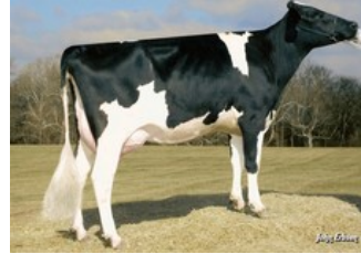
Pine-Tree Martha Sheen VG-86