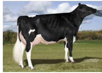
Cookiecutter MOM Halo VG-88