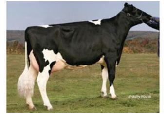
Cookiecutter GLD Holler VG-88