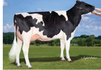
S-S-I Supersire Miri 8679 VG-89, EX-