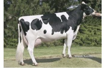
Seagull-Bay Oman Mirror VG-86

Redrock x VG-85 Delta x VG-87 Bookem x VG-86 Shottle x VG-86 O Man x EX-90 Manat x EX-91 Celsius x VG-85 Melwood x VG-85 Secret x EX-91 Tony