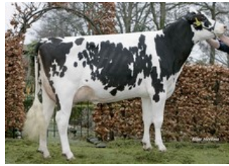
Diepenhoek Rozelle 38 VG-86