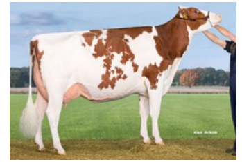
Drouner AJDH Aiko 1288 Red EX-91