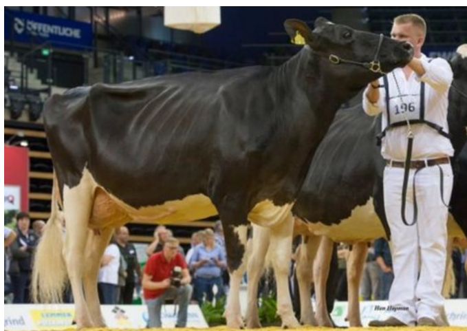
NH HS Marilyn Monroe VG-86