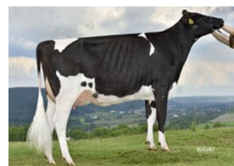
Vekis Sudan Mellow VG-88