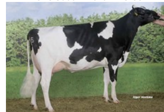
Caps Mairy 4 VG-85

VG-85 Joplin x VG-86 Balisto x VG-88 Sudan x VG-87 Xacobeo x VG-85 Goldwyn x VG-85 O Man x VG-87 Durham x GP-83 Fred x VG-86 Mascot x VG-87 Cleitus