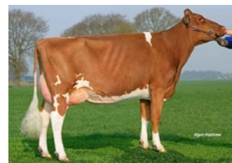
FG Massia 106 VG-86