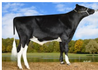
Born P RDC, Battlecry x Coco P-Red