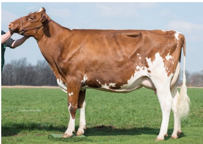
Wilder Coco P-Red VG-86