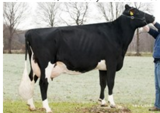
Apina Massia 102 RDC EX-90