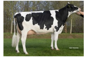
Poppe Fienchen 803 RDC VG-86