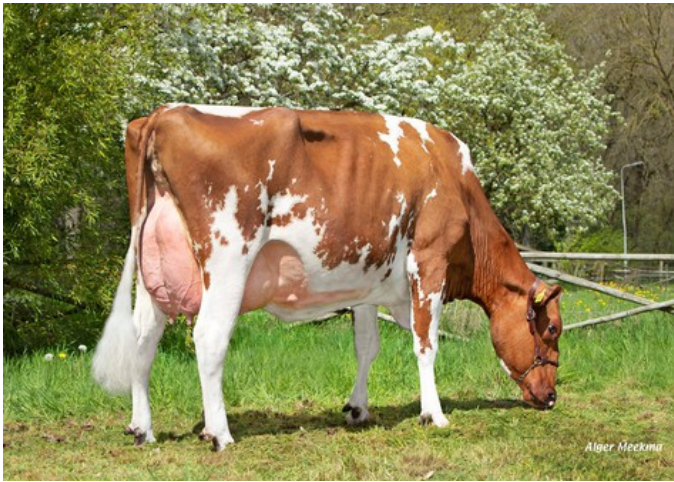
Poppe Fienchen 1569 Red VG-85