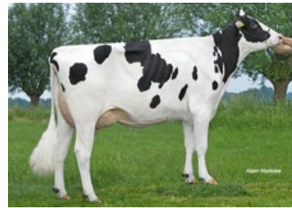
Poppe Fienchen 1134 RDC GP-84