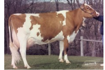
Elites-JSJ Fac Feebe-Red EX-92

VG-85 Born P RDC x GP-84 Silver x VG-86 Danillo x VG-89 Stol Joc x VG-85 Lightning RDC x GP-84 Konvoy x VG-85 BW Marshall x EX-92 Factor RF x VG-88 Leadman x EX-92 Enhancer