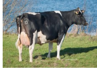
Poppe Fienchen 580 RDC VG-89