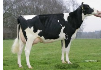
Holbra Manoa VG-85