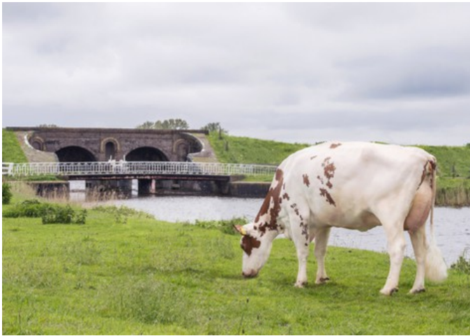
Lakeside Ups Red Range VG-86