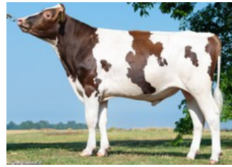
3STAR OH Ranger Red