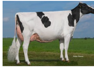
Holec Mogul Panzul VG-88