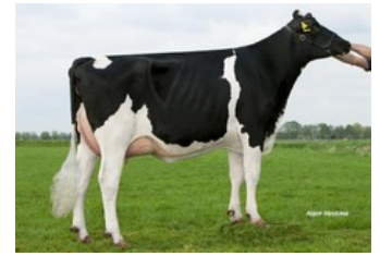
GS Paris VG-87