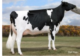
Rabur Gold Panzer VG-87