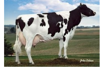
Rabur Outside Pandora EX-91

EX-90 Kingboy x VG-88 Mogul x VG-87 Man-O-Man x VG-87 Goldwyn x EX-91 Outside x EX-91 Rudolph x EX-92 Inspiration x EX-91 Triple Threat x EX-92 Tony