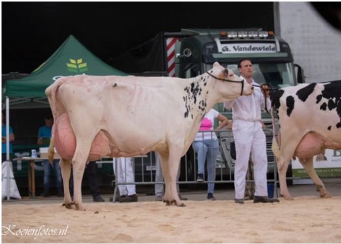
Marieclaire VH Zomerbloemhof EX-90