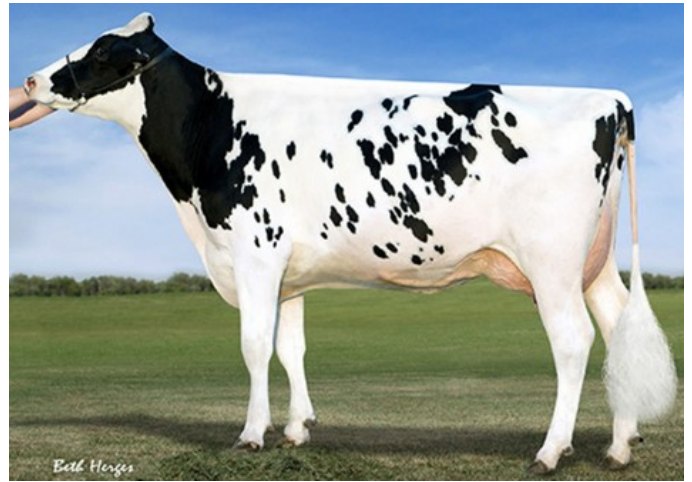
Vision-Gen SH Sho A12037 VG-87

G-79 Montana x Racer x VG-88 Supersire x VG-87 Shottle x EX-91 Goldwyn x EX-92 Outside x EX-94 Skychief x EX-94 Starbuck x Sheik