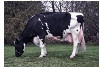
Larcrest Juror Chanel

AltaJackman x VG-85 Altalota x VG-87 Shottle x EX-90 Outside x EX-93 Ked Juror x VG-85 Lindy x VG-87 Inspiration