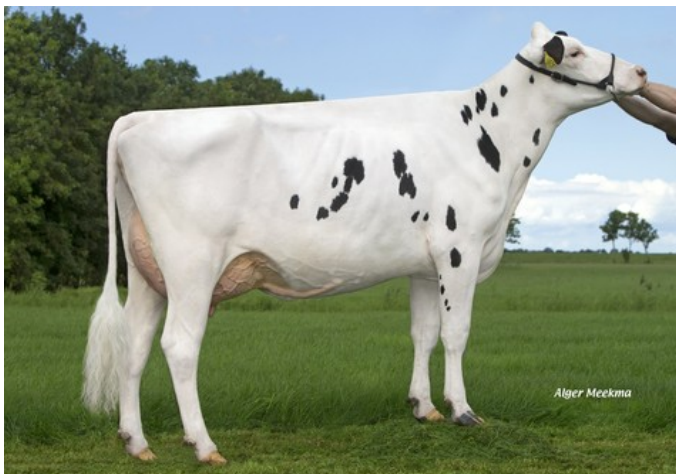
Koepon Bkm Regenia 104 VG-86