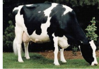
Hanoverhill Tony Rae EX-96