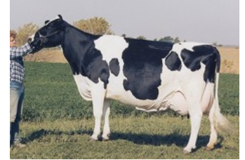
C Glenridge Citation Roxy EX-97

VG-88 Born P RDC x Eloped Red x GP-84 Kingboy x VG-85 Mogul x EX-90 Superstition x EX-90 Pronto x EX-93 Goldwyn x EX-90 Rubens RF x EX-90 Jubilant RF x EX-96 Tony