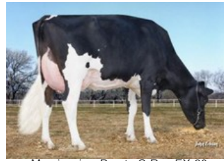
Morningview Pronto C-Rae EX-90