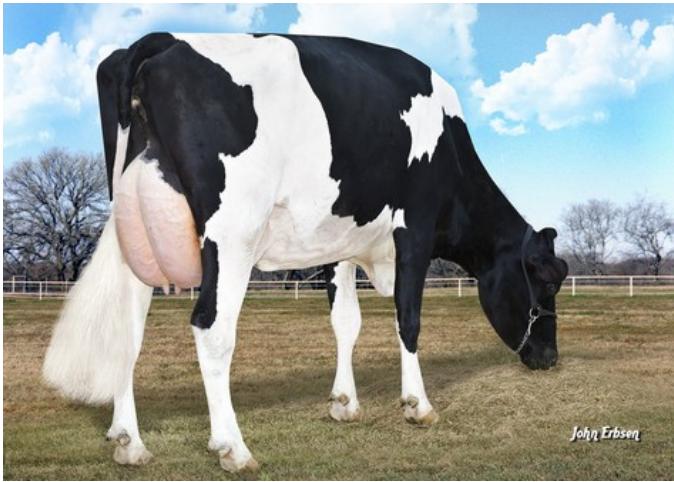
Morningview Super Roxy RDC EX-90