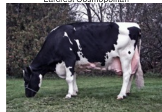
Larcrest Juror Chanel

AltaJackman x VG-85 Altalota x VG-87 Shottle x EX-90 Outside x EX-93 Ked Juror x VG-85 Lindy x VG-87 Inspiration