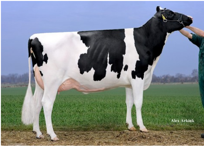
Drouner AJDH Aiko RDC VG-87