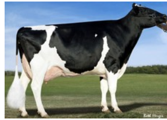
KHW Goldwyn Aiko RC EX-91