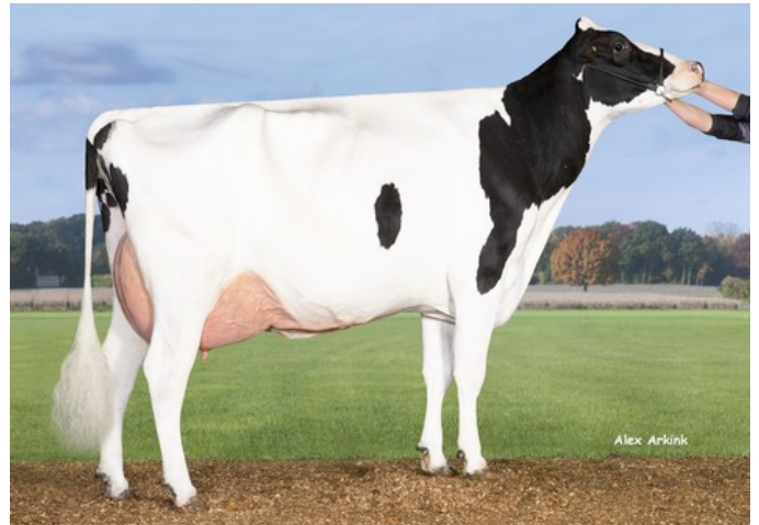
K&L OH Mirror GP-82

VG-87 Einstein x GP-82 Rubi Agronaut x VG-85 Josuper x VG-88 Mogul x EX-91 Socrates x VG-86 O Man x EX-90 Manat x EX-91 Celsius x VG-85 Melwood x VG-85 Secret