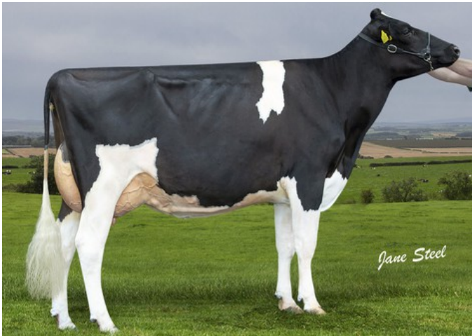
3STAR OH Mironna VG-87