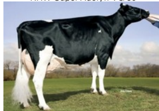
Kamps-Hollow Durham Altitude EX-95