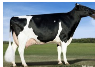
KHW Goldwyn Aiko EX-91