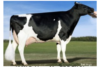
KHW Goldwyn Aiko RDC EX-91