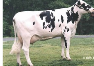
Jafral Prelude Prissy VG-86