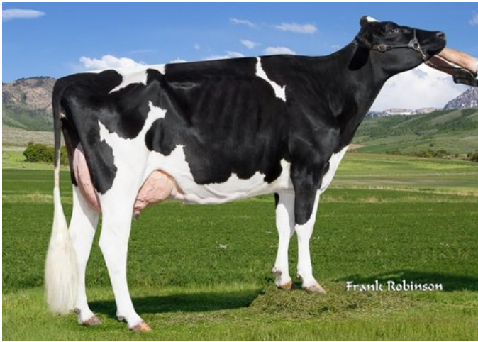
Pine-Tree Dorcy Alexa II VG-88