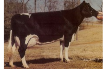
Rilara Mars Las Ravena EX-91

Hotline x Monterey x GP-83 Supersire x VG-88 Dorcy x EX-91 Ramos x EX-91 Boliver x VG-88 Zack x VG-86 Prelude x VG-88 Wister x VG-87 Secret