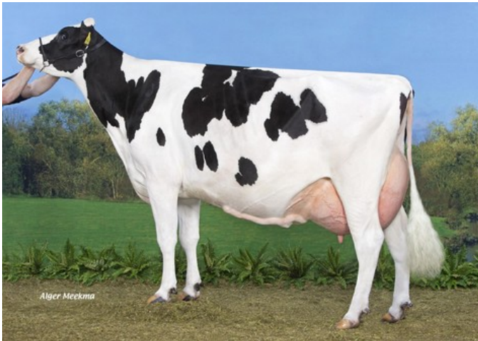
Koepon Iota Classy 98 VG-86