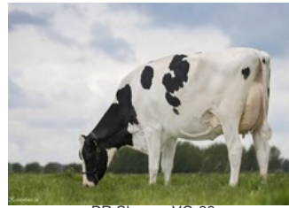
PR Shauny VG-88