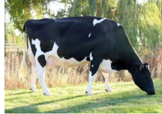
Ammon-Peachey Shauna EX-92