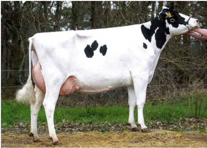
PR Madelon EX-90