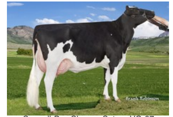
Seagull-Bay Shauna Saturn VG-87