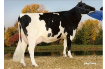
Pine-Tree Missy Miranda VG-86

EX-90 King Doc x VG-88 Modesty x GP-83 McCutchen x VG-87 Man-O-Man x EX-92 Planet x VG-86 Shottle x VG-86 O Man x EX-92 Rudolph x EX-90 Bell Elton x VG-87 Mandingo