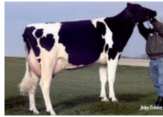
Regancrest Ito Isa VG-86