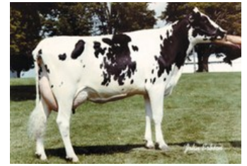
Regancrest Emory Dorissa VG-86