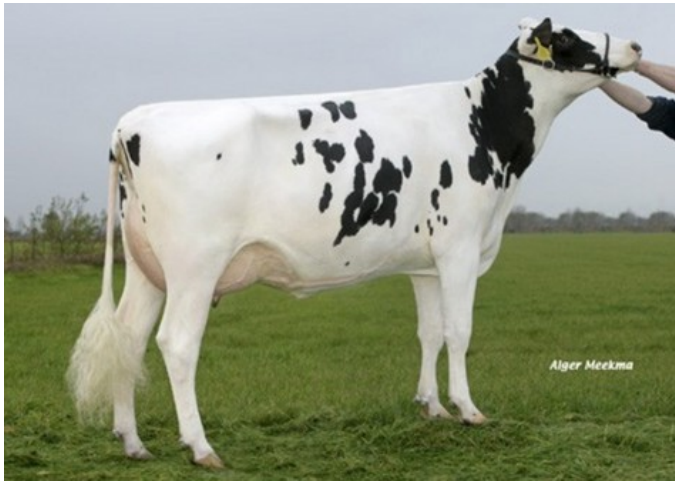
Koepon Shottle Isa 1 VG-87