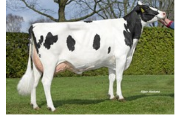
Creijland Delia 1, Solution out of full sister

GP-82 Ronald RC x Pace-Red x VG-88 Nugget RDC x VG-89 Aikman RDC x GP-84 G-Force x VG-87 Goldwyn x GP-84 Shottle x EX-90 Adam x VG-88 Lucky Leo x VG-86 Largo