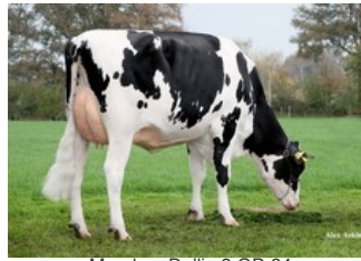
Manders Dellia 8 GP-84