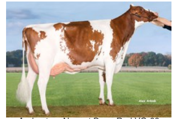
Anderstrup Nugget Dana Red VG-88