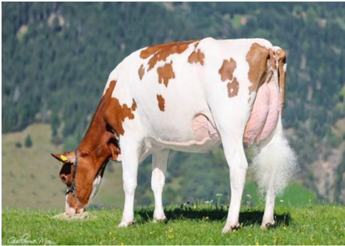
Dykster 3STAR Ronald Layla SG GP-82