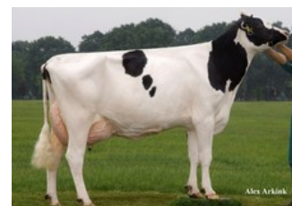
Broeks MBM Elsa EX-90