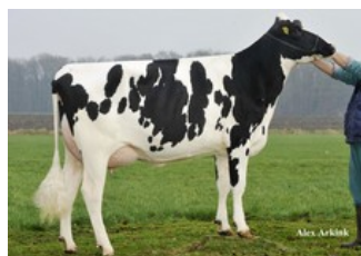
Broeks Madison VG-89