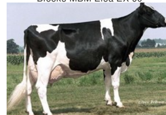
Ever-Green-View Elsie EX-92

Kingpin x VG-85 Garrett x VG-89 Shottle x EX-90 BW Marshall x VG-89 Aaron x EX-92 Bell Elton x EX-90 Grant-Twin x EX-91 Winken Koepon King Madison 7 sells in the GenHotel Selection Sale