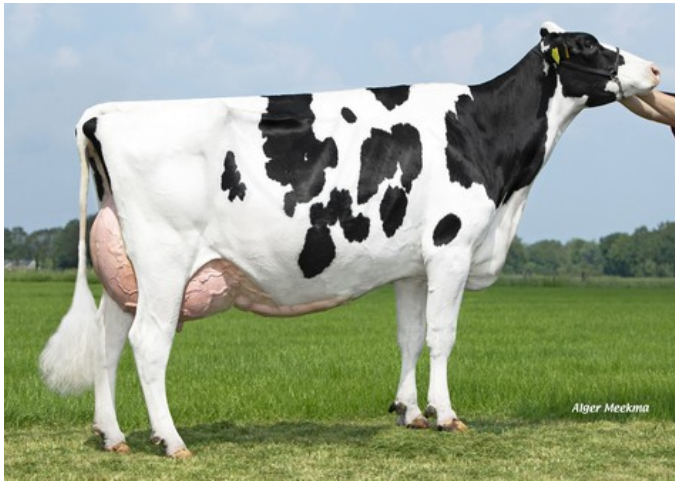
Holbra Malon 8 EX-90