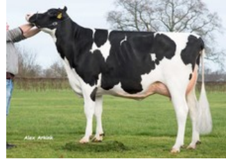
Holbra Malon 3 VG-88