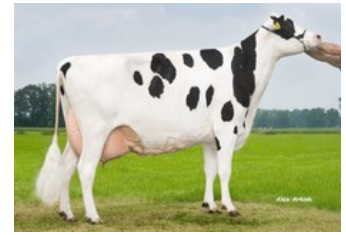
Holbra Malon VG-87