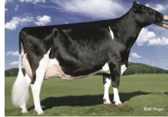
Regancrest-PR Barbie EX-92