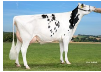
Roccafarm DG Breezer VG-86