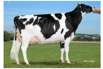
Vendairy Mac Breesh VG-87