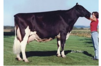
Regancrest Juror Brina EX-92

Battlecry x Platinum x VG-86 Snowman x VG-87 Mac x Shottle x EX-92 Durham x EX-92 Ked Juror x EX-90 Aerostar x EX-91 Chief Mark x EX-90 Chairman