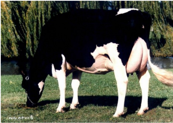
Snow-N Denises Dellia EX-95