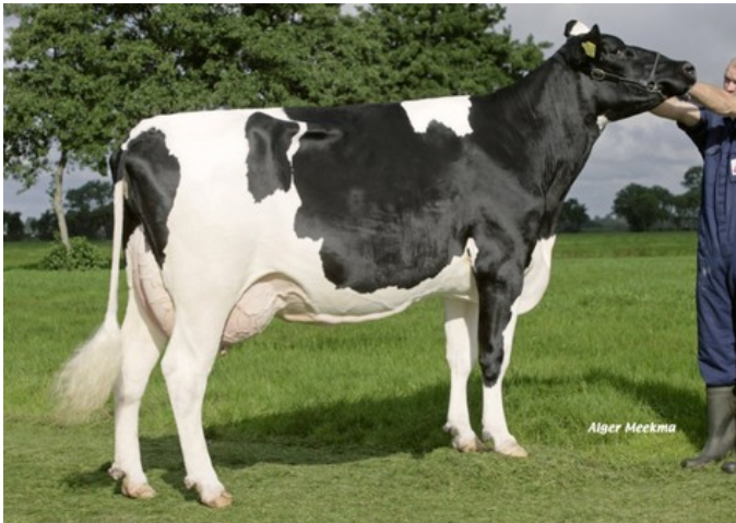
Etazon Renate VG-86