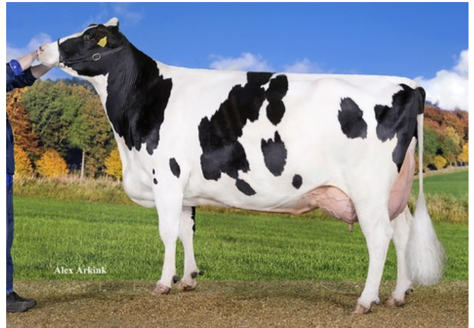
Delta Riant VG-87

VG-86 Penley x VG-86 Epic x VG-87 Bolton x VG-86 O Man x EX-90 Jocko x VG-86 Gibbon x VG-87 Mountain