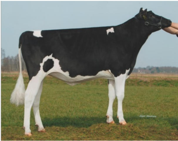
Van de Peelsehoeve Dellia 12 GP-84