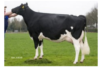
Manders Dellia 1 VG-87