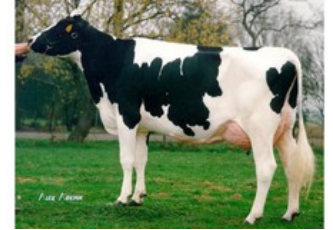
Double Dutch Southland Belle VG-88

GP-84 Galaxy x VG-89 Man-O-Man x VG-87 Goldwyn x GP-84 Shottle x EX-90 Adam x VG-88 Lucky Leo x VG-86 Largo x VG-88 Jabot x VG-87 Southwind x VG-85 Chairman