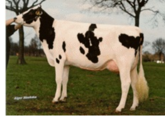
Southland Dellia 2 VG-88