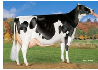
Manders Dellia 5 VG-89