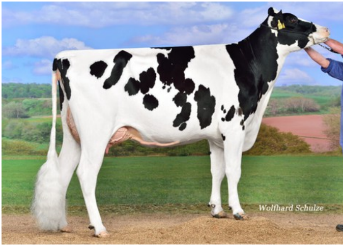
KNS Georgia-P GP-84