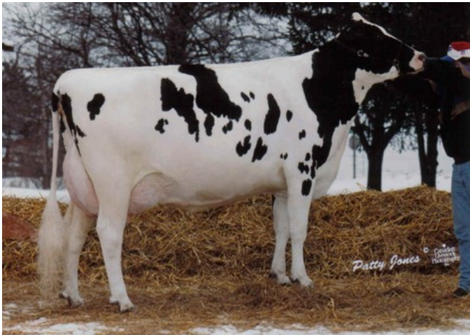
Glen Drummond Aero Flower VG-88