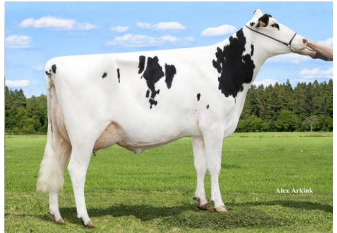
DKR Silence Secret RC VG-85

Silver x GP-83 Earnhardt P x GP-82 Colt P x VG-85 Socrates x VG-87 Goldwyn x VG-87 Durham x VG-86 Formation x VG-88 Aerostar x EX Enhancer x EX Christopher