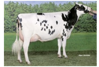
Southland Dellia 130 VG-87