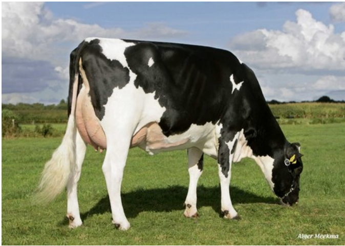
Southland Dellia 9765 VG-86