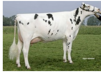
Southland Dellia 152 VG-87