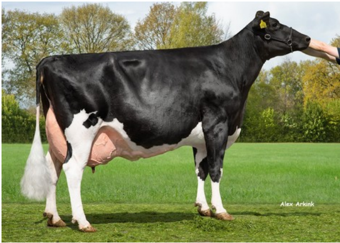
Willsbro K&L Nugget Aderyn RDC VG-87