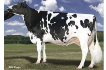
Larcrest Outside Champagne EX-90

VG-85 Freddie x VG-87 Planet x EX-94 Ramos x VG-87 Shottle x EX-90 Outside x EX-93 Ked Juror x VG-85 Lindy x VG-87 Inspiration