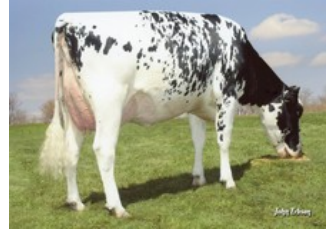
Larcrest Cosmopolitan VG-87