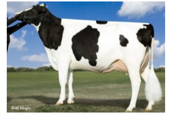
Larcrest Chenoa VG-87