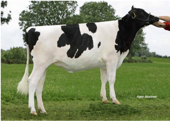
Bacchus Chennin VG-85