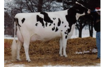
Glen Drummond Aero Flower VG-88

Rubicon x GP-83 Cashcoin x VG-87 Snowman x EX-90 Planet x VG-85 Bolton x VG-87 Goldwyn x VG-87 Durham x VG-86 Formation x VG-88 Aerostar x EX Enhancer