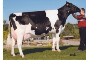
Gen-I-Beq Durham Sherry VG-87