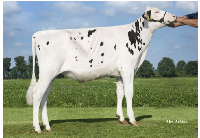
Dyment DG Earn So PP RDC GP-83

Supershot x GP-83 Earnhardt P x GP-82 Colt P x VG-85 Socrates x VG-87 Goldwyn x VG-87 Durham x VG-86 Formation x VG-88 Aerostar x EX Enhancer x EX Christopher